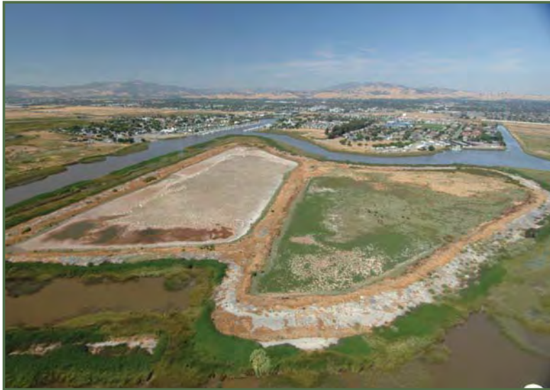
View of Pierce Island and waterways to be dredged

Mention scenic waterways to most people and they immediately conjure images of wildlife, kayaking, fishing and boating. But very few will come up with an activity vital to a living waterway – “sucking up the mud.”