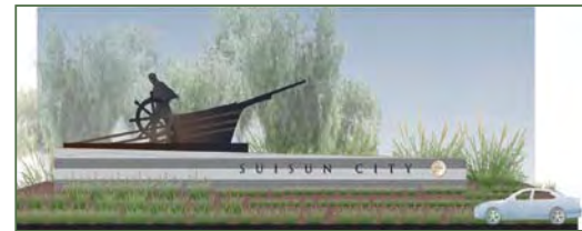
Proposed design for gateway signs